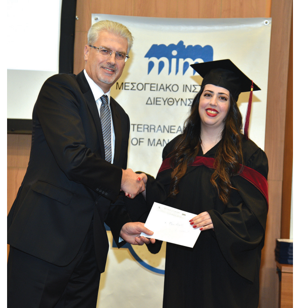
An MBA graduate receiving an Award by the General Manager of Scientronics