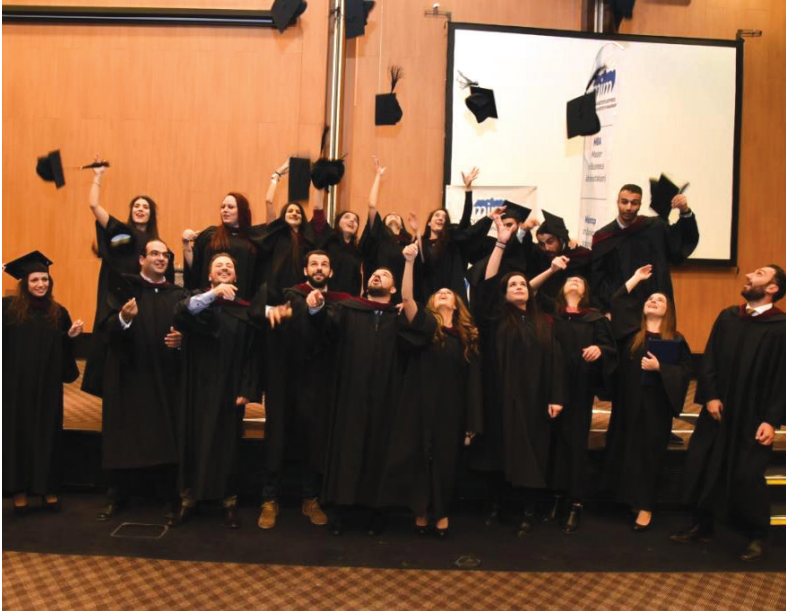
Graduates of the MBA Programme