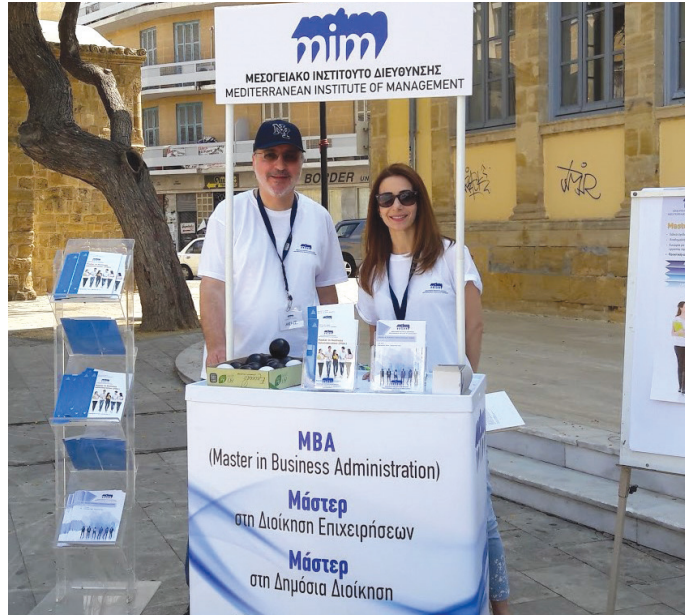
MIM postgraduate programmes promotional event