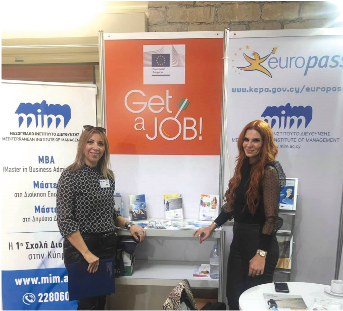
Participation of MIM at a Career Expo