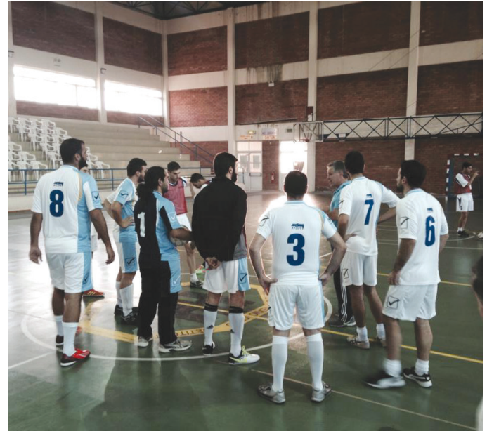
Futsal game by MBA students' team