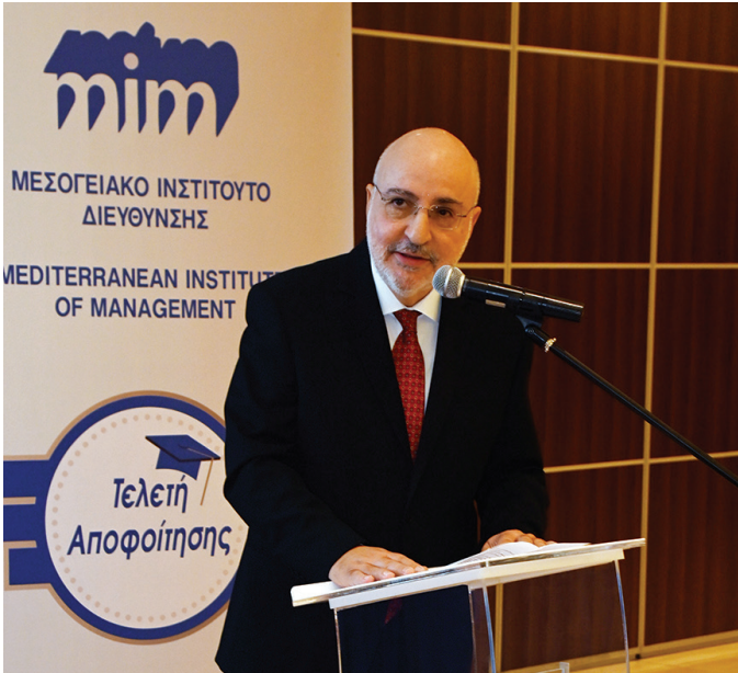
The MIM Manager addressing a Graduation Ceremony